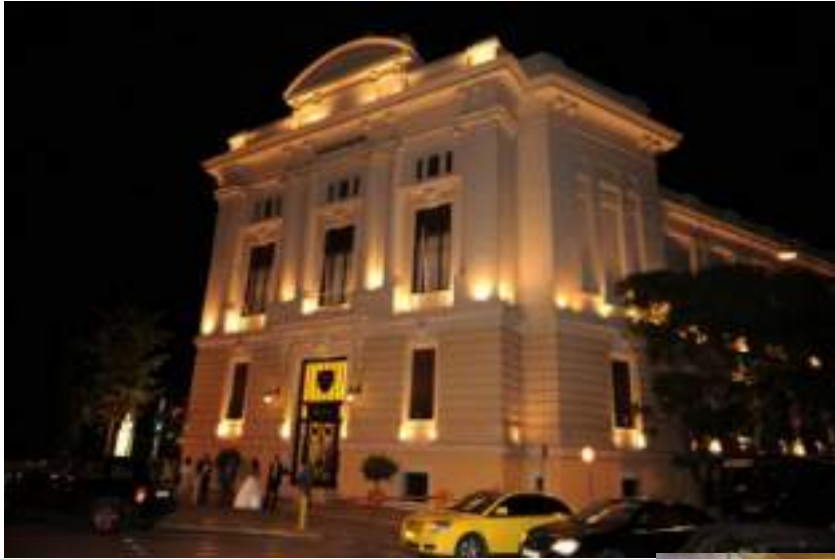
Officer Club of Athens