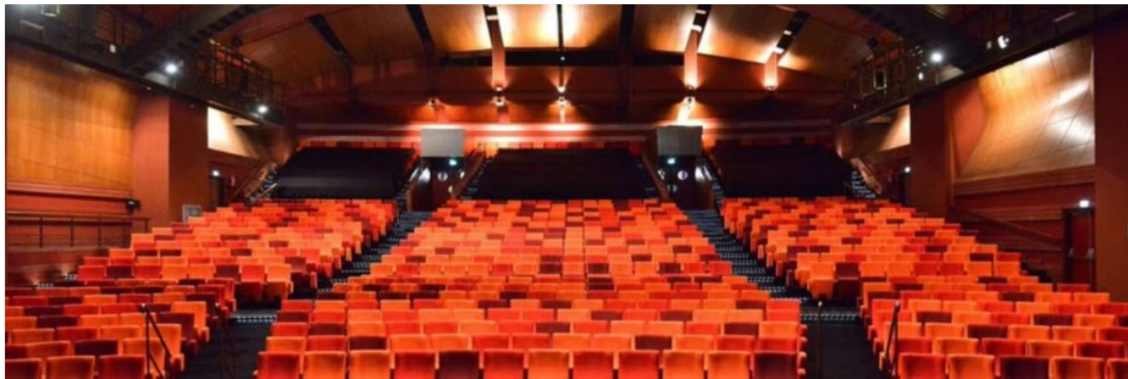
Le Palais des Congrès d'Issy